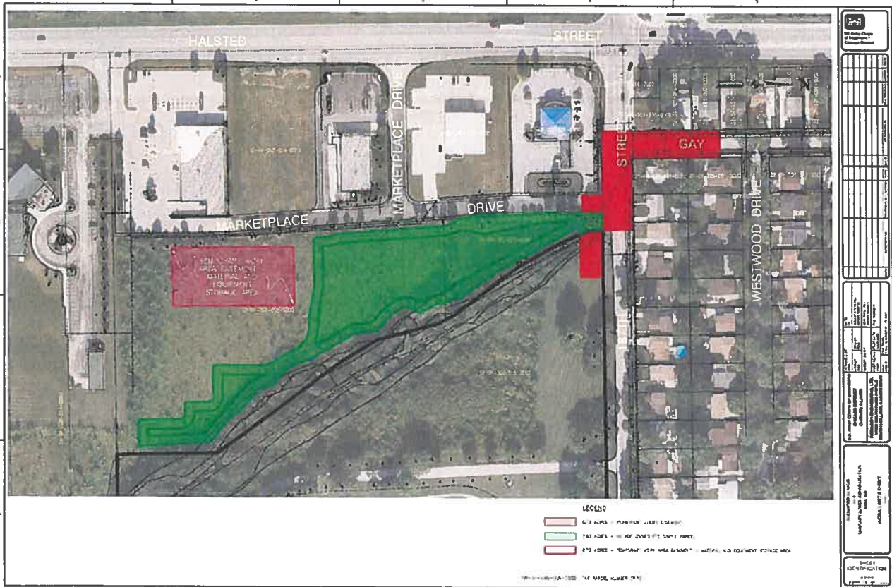
EXHIBIT "A" Project Area Map